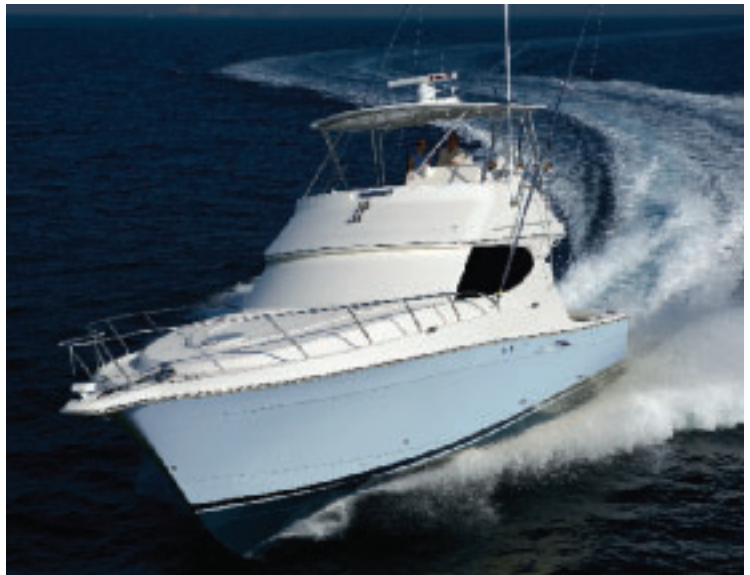
In August 2006, Silverton launched a version of its 50 Convertible equipped for competitive sportfishing...the 50T-Series...