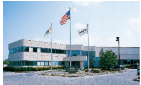
Manufacturing facility in Millville, New Jersey