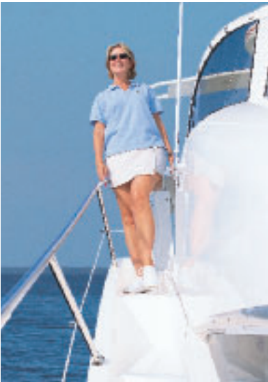
SideWalk® flybridge-to-foredeck passage