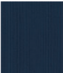
Navy Blue Sunbrella®