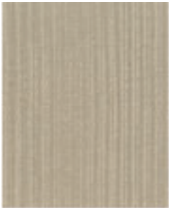
Dove Tweed Sunbrella®