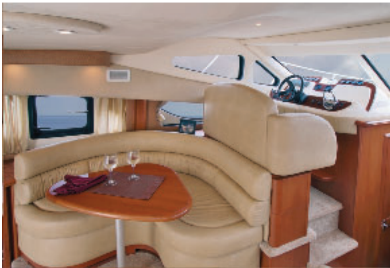
Optional lower helm