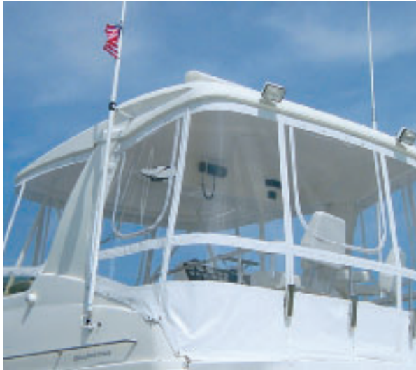
42 Convertible Hardtop Enclosure in White Stamoid®