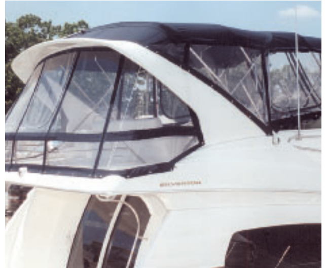
43 Sport Bridge Bimini Enclosure in Navy Blue Sunbrella®