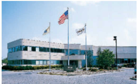
Manufacturing facility in Millville, New Jersey

Leadership has its obligations. Silverton's is to build boats that people will be proud to own. Pride of ownership is, ultimately, the greatest value any company can deliver. Silverton's pride is to deliver that value consistently.